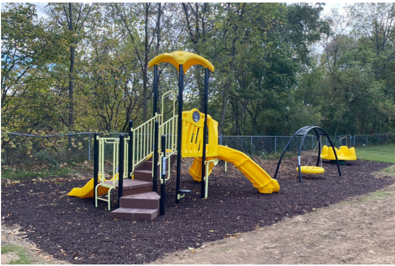
Left photo: The Midland Rotary Foundation awarded a $5,000 for the Bridge Food Center expansion project. Pictured right: The West Midland Family Center received $5,000 to build a Bullock Creek Elementary preschool playground.